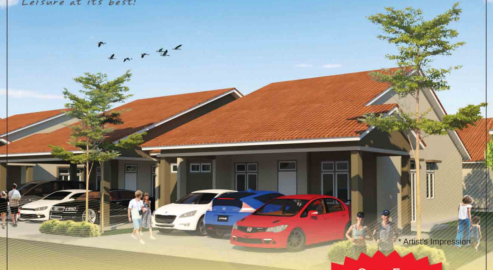
* Artist's Impression